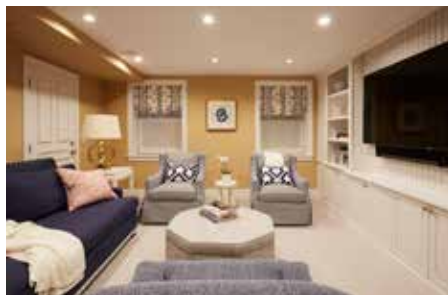
This page: A natural-and-blue color scheme flows throughout the lower level. Matching wainscot, cabinetry and trim extend throughout the house, but are painted blue in the cheery mudroom and gym.