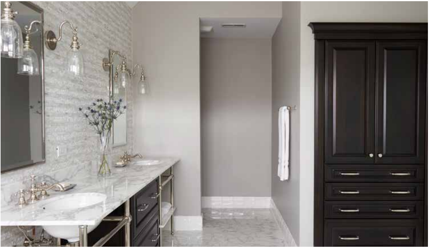
Raised-panel cabinetry in a rich java finish was custom designed and fabricated to suit the space.