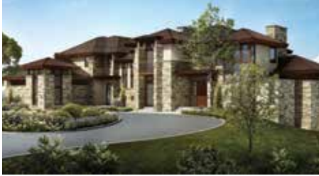
Breathtaking 6,300 s.f. concept home Valley's Edge received top honors—A Crystal Key Award for Innovation and Design and the Gold Key Award for Excellence in New Construction.