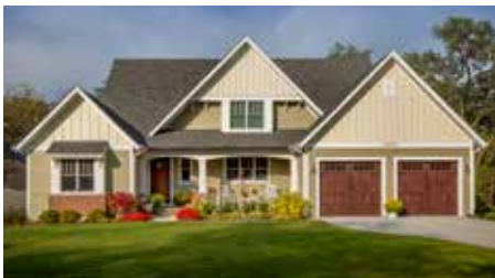
This stunning jewel box was awarded a Gold Key for Excellence in New Construction thanks to its Craftsman style and impeccable attention to detail.