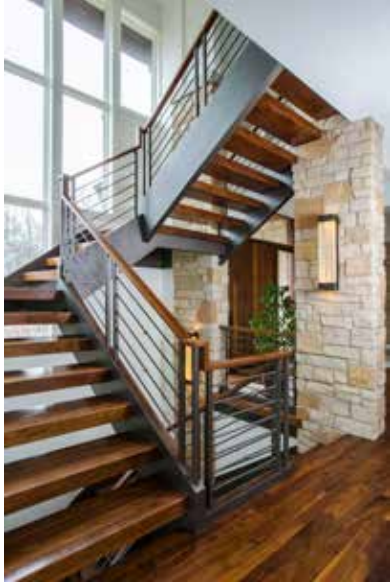
Floating, open tread, 3"x12" walnut staircase with interior stone columns.

This year, we had two great opportunities to marry progressive design and technology with family-friendly living. Of course, even though we consider these "concept houses," we weren't creating them for ourselves or a magazine. They're homes for real people.