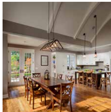
Open concept kitchen/dine-in/great room space with vaulted/beamed ceiling detail. Traditional white recessed panel shaker cabinetry.