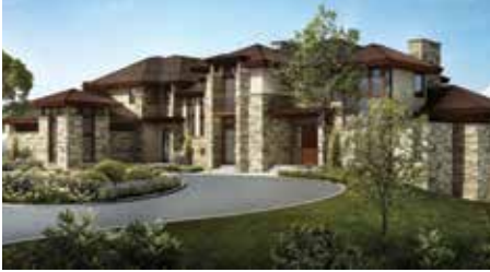
Breathtaking 6,300 s.f. concept home Valley's Edge received top honors—A Crystal Key Award for Innovation and Design and the Gold Key Award for Excellence in New Construction.