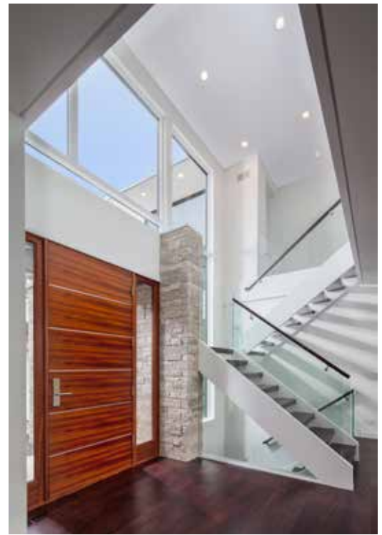
Two-story entry foyer. The front door is African mahogany with horizontal aluminum inserts. Staircase has 3" red oak treads, red oak handrails, open risers, and glass balustrade.