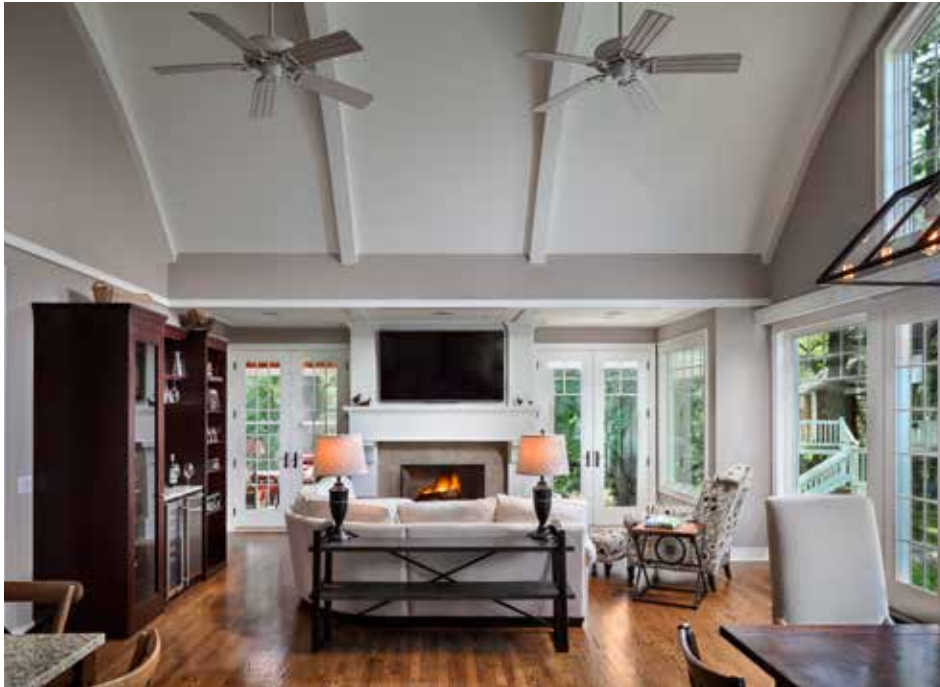
The great room/family room features a vaulted ceiling accented with painted beams and a pair of 8' french doors—one set leads to the screen porch, the other to the outdoors.

In a jewel box home, it's the details that really make the space shine.