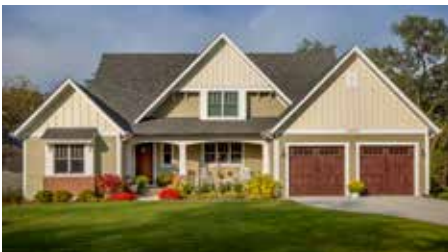
This stunning jewel box was awarded a Gold Key for Excellence in New Construction thanks to its Craftsman style and impeccable attention to detail.