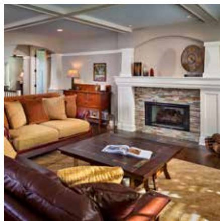
This cozy family room features boxed beam ceiling details, detailed millwork, craftsman columns and stone clad fireplace.