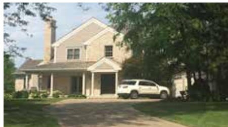
A 3,400 s.f. renovation (an addition of 1,700 s.f.) created a magnificent family estate that deserved its Gold Key for Excellence in Remodeling.