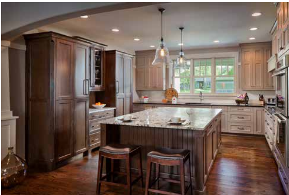
Large chef's kitchen with fully paneled refrigerator and freezer, large island, and beautiful "latte" finished cabinetry.