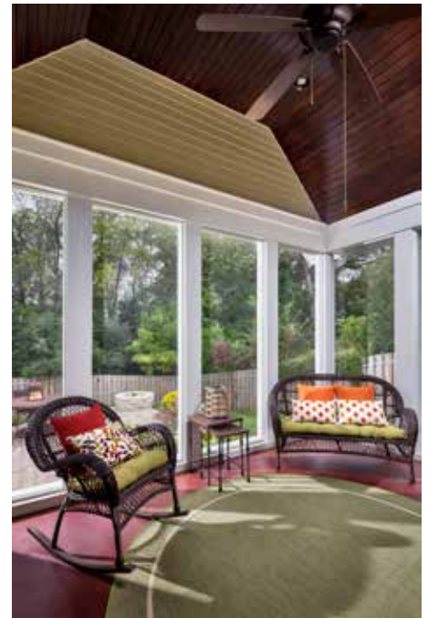
1x4 v-groove pine on ceiling in mahogany finish. Floors are stained concrete.