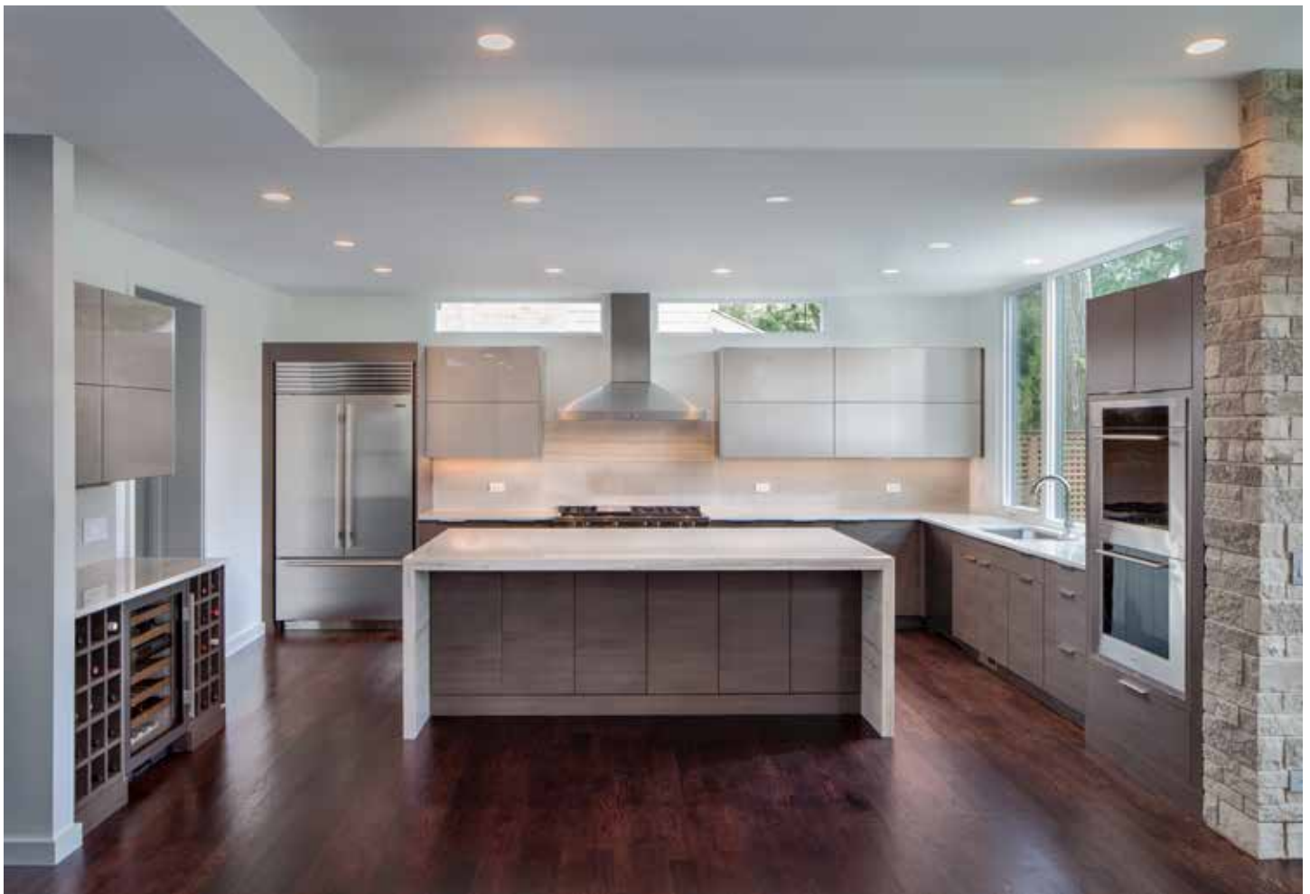
Sleek contemporary kitchen features Brookhaven cabinetry. Upper cabinets are mechanized bi-fold lift up doors with back painted glass finish. The lower cabinets feature matte gray tones and utilize a volcanic sand finish. Waterfall-edge quartzite countertop. Clerestory windows above.