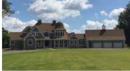
The sprawling 4,750 s.f. coastal residence with an additional 2,740 s.f. lower level sits on ten acres in Chesterton, IN and was awarded a Gold Key for Excellence in New Construction.