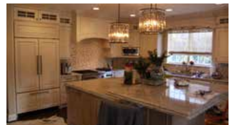
With a new open flow and thoughtful cabinetry in maple and white, this kitchen was recognized with a Gold Key for Excellence in Remodeling.