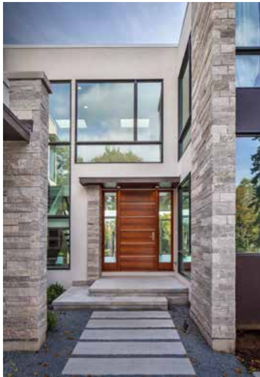
Front entry is a contemporary mix of glass, stone, and stucco. Gravel entry court with decomposed granite chips. Front door is African mahogany with clear glass sidelights and horizontal aluminum inserts.

Floor-to-ceiling windows and minimal trim present challenges unique to modern homes. With no draperies or crown molding to distract the eye, framing and finishes need to be spot-on. Pickell architects and designers worked together to achieve the exacting results necessary.