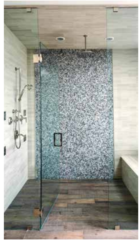
The master bath shower features stunning mosaic tile with rain forest shower head, body sprays, and handheld shower.

A varied footprint creates a striking interplay of light and shadow across the exterior, and brings together stone, stucco and corten steel. Inside, American walnut takes center stage in the floors, slab stairs and an oversized pivoting front door. The wood is complemented throughout by natural stone and burnished metal. The kitchen and baths express a lighter aesthetic, marked by glass, tile and stainless steel. While every view is designed to impress, what you can't see is just as important—advanced lighting and home controls, wallboard that cleans the air and muffles sound, and much more.