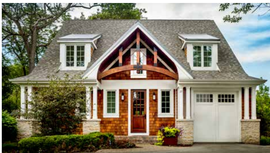
Stone and natural cedar shake entry with timber and iron arched detail. The entry features square columns on stone pier base and corrugated metal on the two shed dormers.