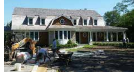
This Nantucket-style home, designed to surround a pair of empty nesters with luxury, earned a Gold Key for Excellence in New Construction.