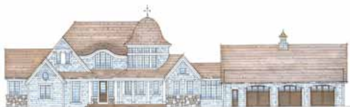
Nantucket style house on 10 rolling acres in Chesterton, Indiana