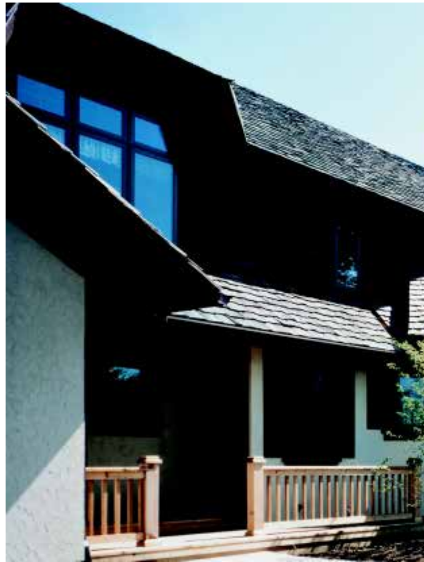
▲ A contemporary home with Scandinavian influence. Far right: Formal entryway leading to a sweeping stairway, grand foyer, and great room.

As you can see, the variety is indeed endless. No two homes are the same and that’s what makes this such an interesting and exciting process, time and time again.