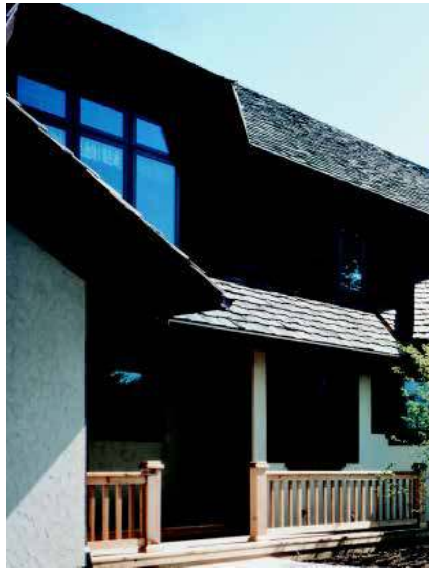
▲ A contemporary home with Scandinavian influence. Far right: Formal entryway leading to a sweeping stairway, grand foyer, and great room.

As you can see, the variety is indeed endless. No two homes are the same and that’s what makes this such an interesting and exciting process, time and time again.