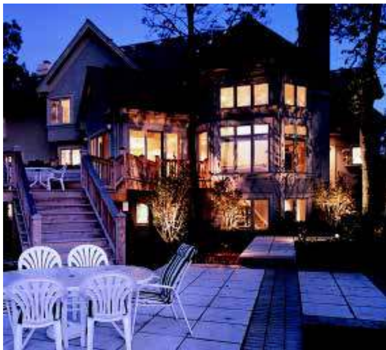
▲ In an Orren Pickell custom-built home, client tastes and needs dictate the style, not vice versa. Shown is one of our formal French designs.