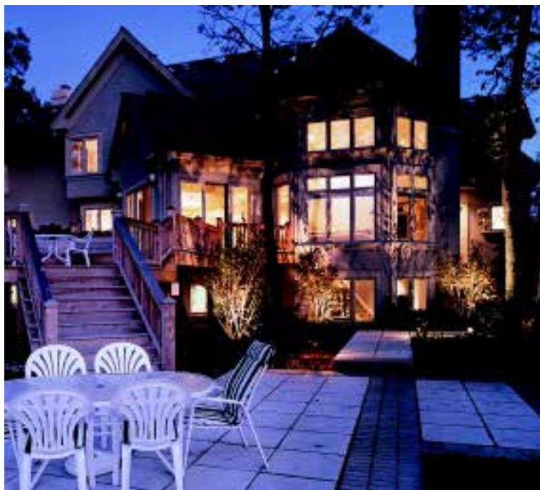
▲ In an Orren Pickell custom-built home, client tastes and needs dictate the style, not vice versa. Shown is one of our formal French designs.