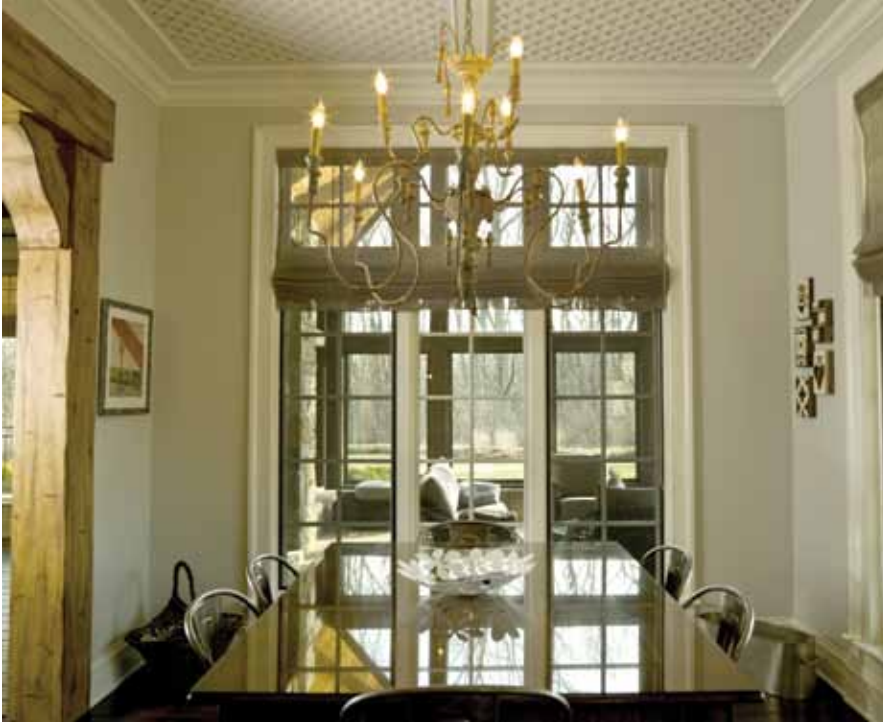
The breakfast room is flooded with light and features a unique latticed ceiling set into the crown moulding.

Orren Pickell Design Group enjoys a rich history of designing and building award-winning homes, including this exceptional estate, which was awarded a Crystal Key from Home Builders Association of Greater Chicagoland (HBAGC). Built for entertainment and private enjoyment, this traditional home boasts function without compromising incredible design. A neutral palette of grays with metal elements allows design details and the homeowner's personal aesthetic to shine through in all rooms of the home. Built for a family with two young children, we incorporated unique and practical storage spaces, but never at the expense of beautiful design and superior craftsmanship.