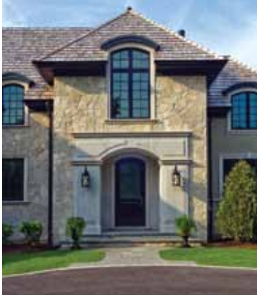
The stately limestone entrance to the Moreland Home.