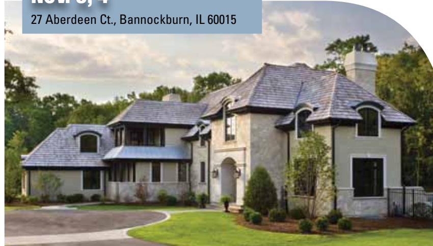
The newest addition to the Bannockburn community.