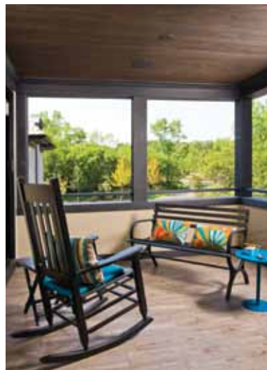
Left: Feel the breeze from the sleeping porch. Right: Custom cabinetry in the powder room.

Get inspired and see At Home Getaway for yourself when the home opens to the public for weekend tours. Join us from 11:00 AM to 4:00 PM on Saturday and Sunday, October 20 and 21, October 27 and 28, and November 3 and November 4. Admission is free, but donations of unused and unwrapped toys are being accepted at the door for Toys for Tots.