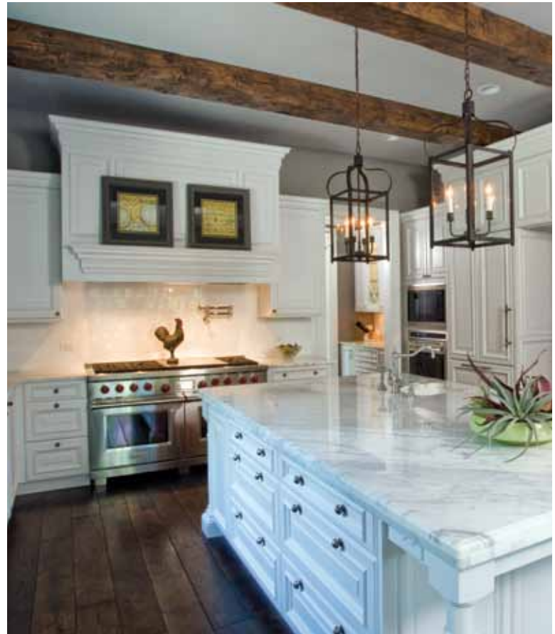
Orren Pickell Signature Collection cabinetry with Carrara marble countertops and reclaimed wood beam ceiling.

They looked to Orren's team to implement design elements from The Scottish Manor into their new home,