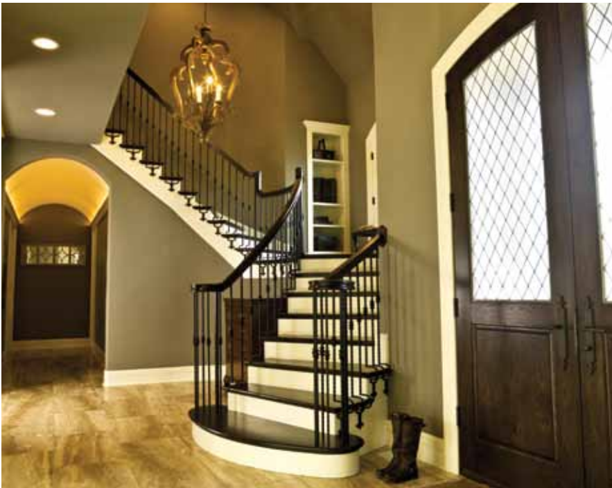
The open staircase with its custom metal balustrade wrapping the stair treads.