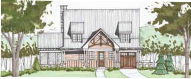
A craftsman-inspired home in Olympia Fields