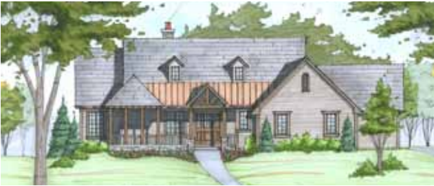
A retreat in Woodstock