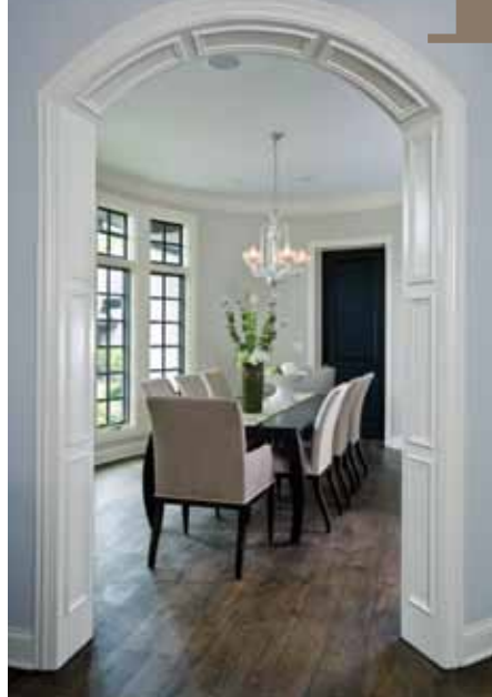
Outstanding design elements, including intricate trim details and a soaring beamed ceiling earned this Tarns of the Moor residence the Gold and Crystal Key Awards in 2009.