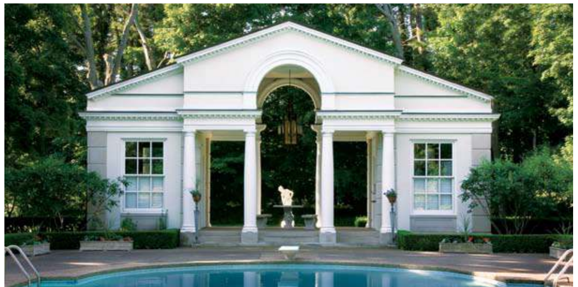
The pool house at Lansdowne.