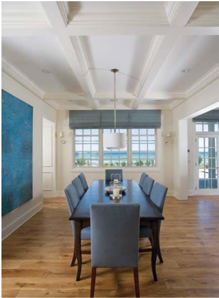
Dinner by the lake? See page 5.