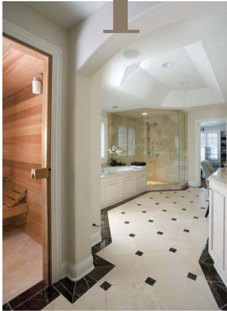
Spa oasis in award-winning remodel. See page 3.