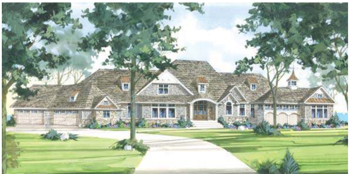
Custom home illustration for a client brought multiple bids for a home that had been on the market for over a year.