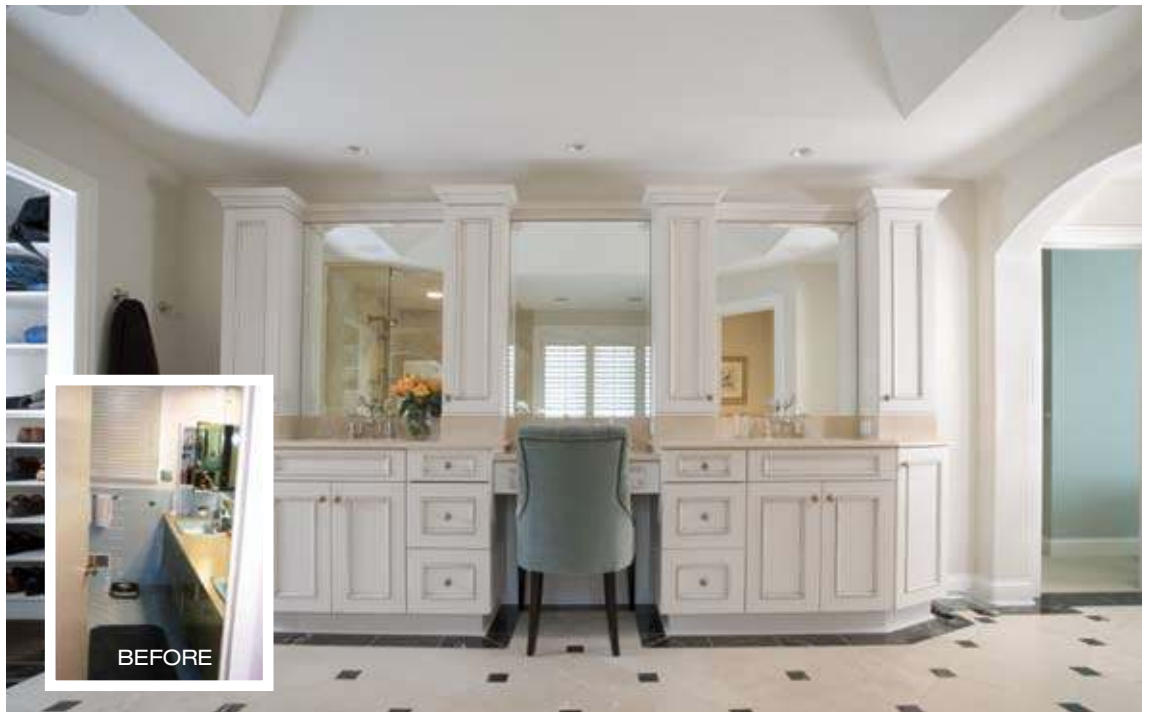
New master bath suite features an elegant double vanity.