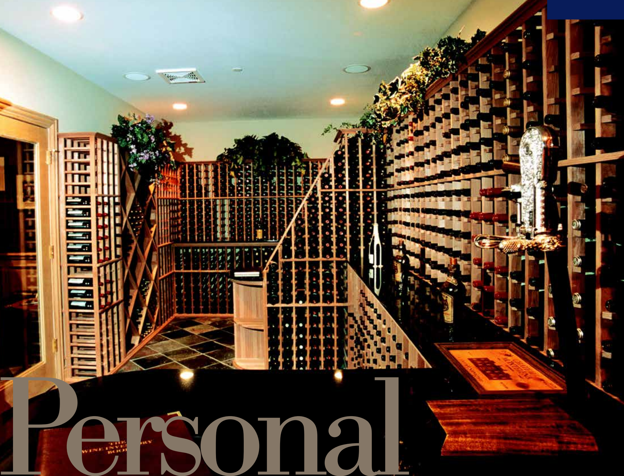
▲ Wine, anyone?