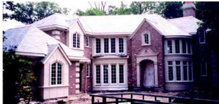
Under construction: The Renaissancedot.com House, 156 Maple Hill, Glencoe.

The Renaissancedot.Com House will be open 1-4 pm most weekends from November through January, or can be viewed by special appointment. Please call the Orren Pickell Designers & Builders offices for specific dates, holiday hours and additional information. Its purchase price is $3,489,000.