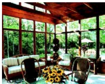
▲ Glorious natural light envelops this warm, delightful sun porch.