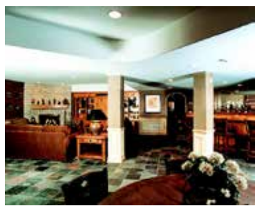
▲ Handcrafted cabinetry helps turn this lower level into a grand retreat.

It would be unfair to describe this home without taking special note of the incredible use of millwork. From walnut in the Great Room to cherry in the Master Bedroom, exquisite woods were used in every area. Handsome built-ins were specifically created to display the family's crystal collection. The grand beams on the high ceilings of the keeping and Great Rooms were actually designed by one of the homeowners. In fact, the couple contributed designs for many of the home's most beautiful details, including a stunning wood-framed mirror in the powder room, the redwood wine cellar, and the distressed-pine bar in the leisure room. This house was truly born from the creativity and imagination of the homeowners and orchestrated by the architects (in our Design Group)—exactly the way it should be for a true dream home.