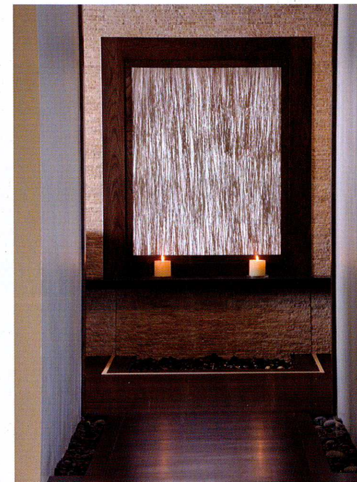
This luxurious master bath at IMAGINE Your Home by Orren Pickell features dark stained wenge floors and a custom fountain with granite surround. The water cascades over the wall to offer the tranquil sounds of a waterfall for a relaxing, spa-like retreat.