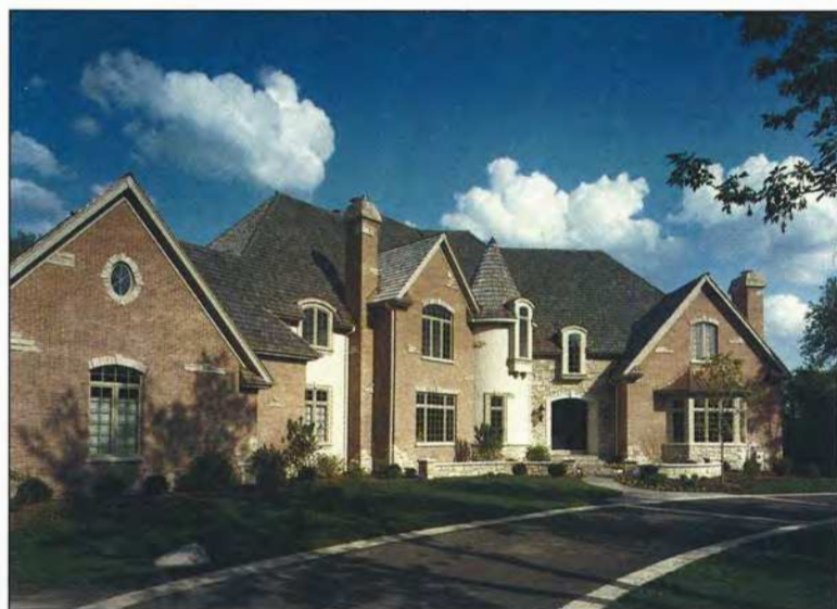
The two-story family room links to the breakfast area and kitchen at left (top). The front elevation blends brick, stucco and stone with natural cedar shake roofing (bottom).

thick archways and between painted wood columns and trim.