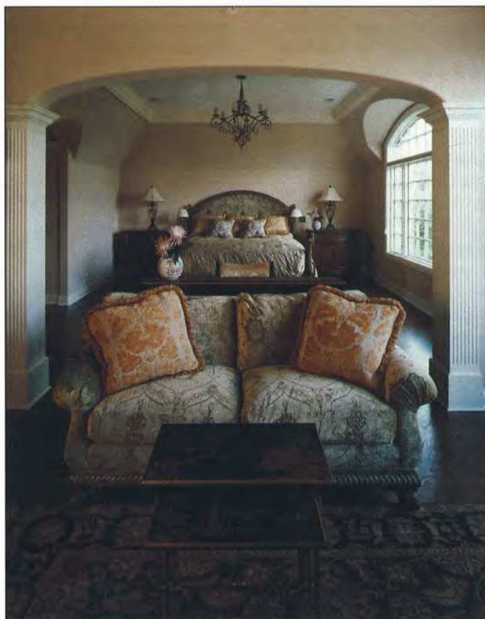
A sitting area with a built-in TV is separated from the 16- by 18-ft. master suite by an arched ceiling detail.

The different people and departments at Orren Pickell Designers & Builders operate with a shared purpose and vision in mind. Because of its size and scope, the company