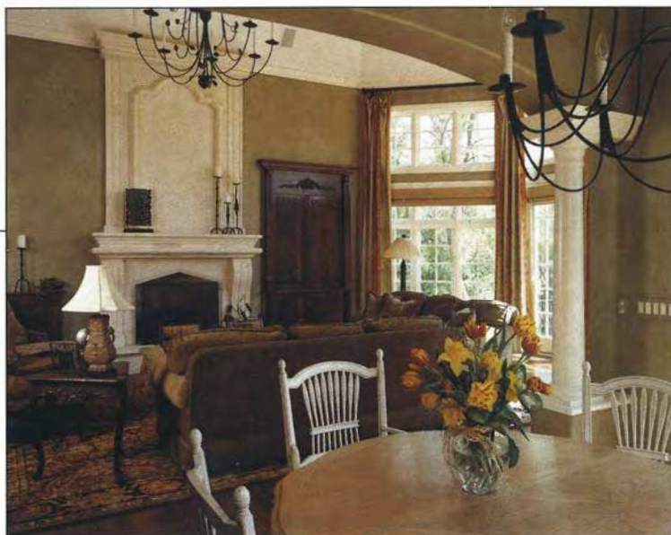
Oak floors, cherry cabinetry, a stone fireplace, wrought iron lighting and painted columns and trim accent the family room.

needed to offer contemporary practicality while remaining consistent with the Old World look of the home. The synergy between Orren Pickell Designers & Builders and its subsidiary kitchen design firm, CabinetWerks, provided the solution.