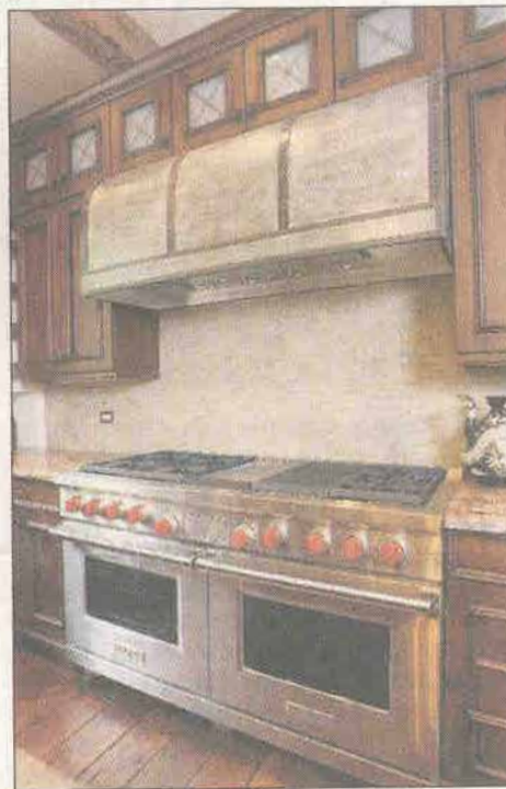
The aged zinc hood softens the modern stainless steel range.