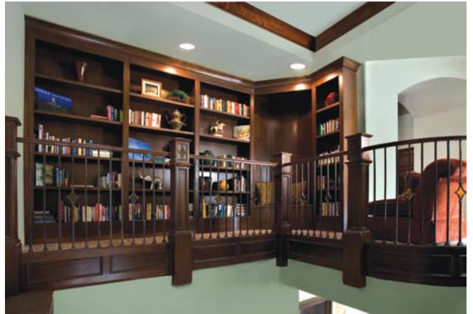
IMAGINE's pocket library is a favorite among visitors.

IMAGINE is open seven days a week: Monday through Saturday 10 am- 6 pm, Sunday 11 am- 5 pm or by private appointment. For additional information, call 847.572.5252 or visit www.ImagineByPickell.com .