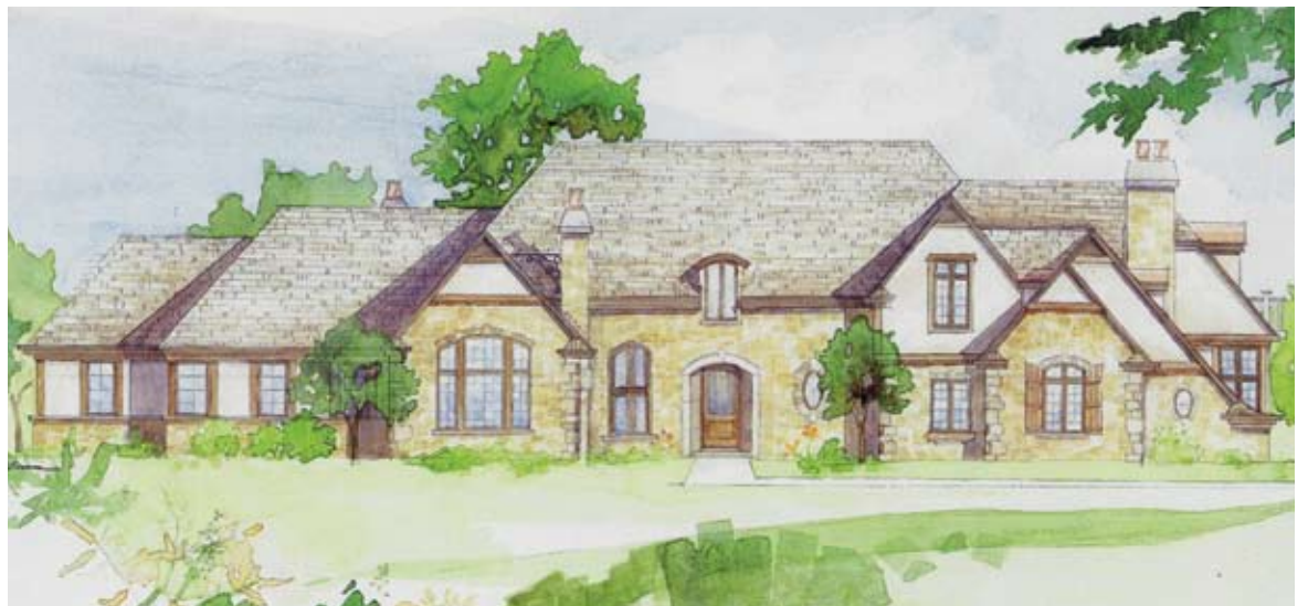
The Scottish Manor will be our next Concept House at Tarns of the Moor in Bannockburn.

Ten heavily wooded estate sites designed to protect native trees and conservancy areas range from 2.2 to 3.7 acres and are each available from $1.2 million. All homes will be designed and built entirely to the owner's specifications by the award-