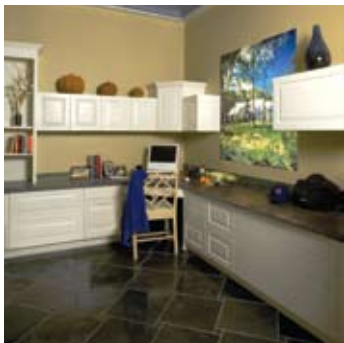
The Family Workshop

Home maintenance experts will present special tips on caring for your home. Our remodeling pros will also be on hand.