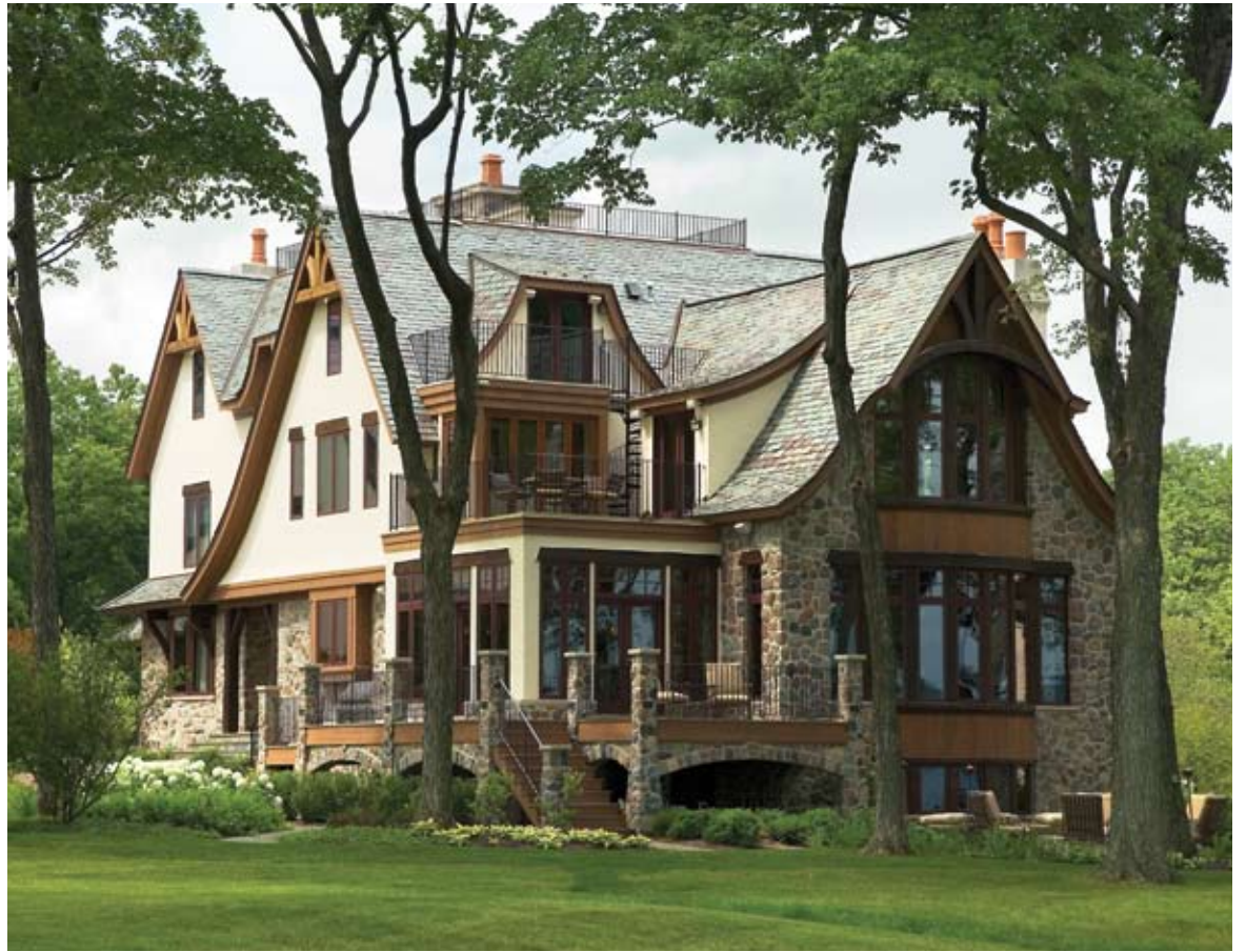
This expansive custom home in Lake Geneva, Wisconsin took home the Gold!