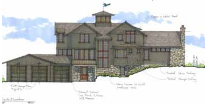
Rustic retreat on private island in Lake Beulah, Wisconsin