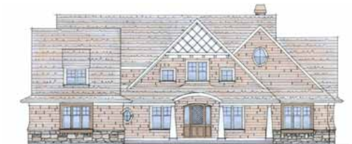
Coastal style house on three acres in Lake Geneva, Wisconsin