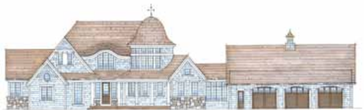
Nantucket style house on 10 rolling acres in Chesterton, Indiana