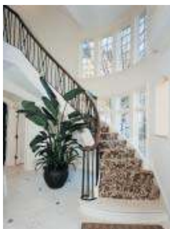
▲ Top: The Entertainment House; Above: The sweeping front staircase of the Renaissance.com House. Others, clockwise from top: The library of the Renaissance.com House is done in Walnut; the kitchen in the Renaissance.com House features Wood-Mode custom cabinetry and includes more than meets the eye, like a super deep sink, Sub-Zero refrigerated drawers, a Miele cappacino machine, double drawer Fisher & Paykel dishwasher (each works independently), and an Internet connected computer than controls the whole house; The spectacular kitchen of the Transition House, again by CabinetWerks, featuring pine Wood-Mode custom cabinetry; and the front of the Arts and Crafts inspired Jewel Box.