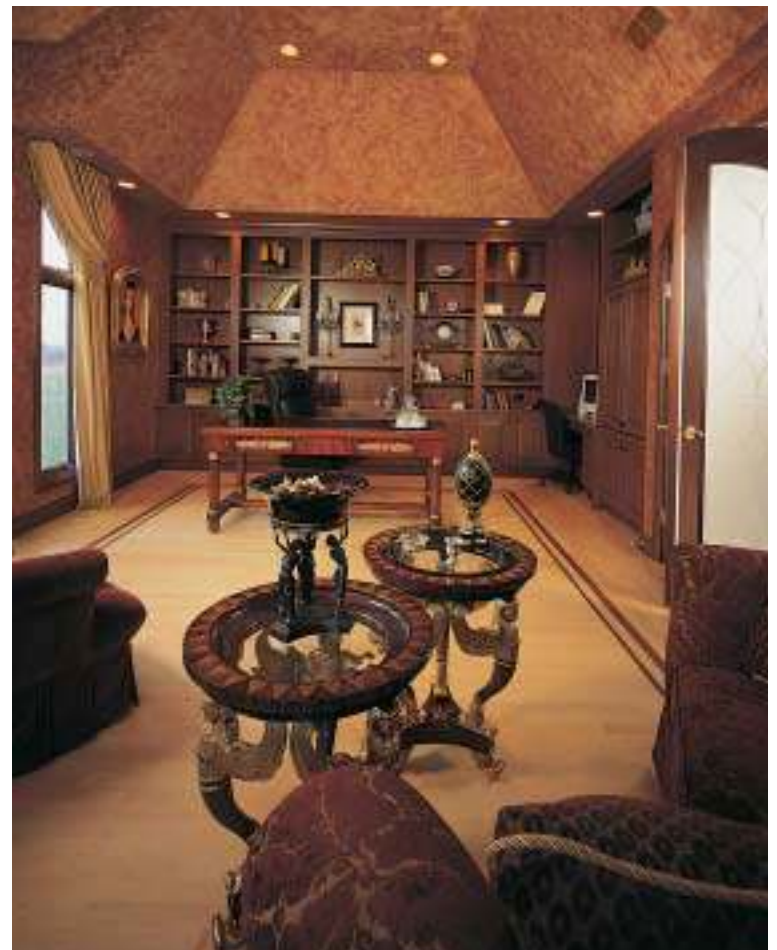
▲ Top and Below: Two remarkable formal French designs, inspired by the Design Group's trip to France. Above: The interiors are as exquisite as the exteriors. Our architectural designers create aesthetic spaces you and your family can enjoy every day of your life.