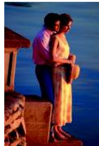
▲ Everyday life at the South Shore Club includes boating, tennis, melting tensions away in a sauna, and a bit of romance.