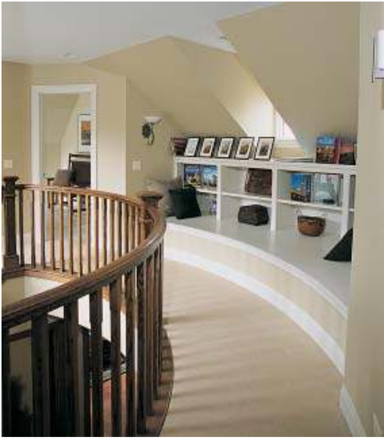
▲ This reading nook in the Architect's Cottage is over 10 feet long, so teens and/or parents can read toe-to-toe.