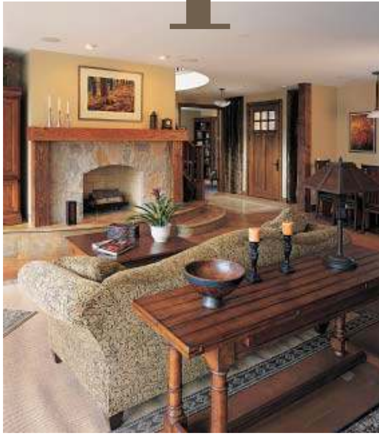
▲ The Great Room of the Architect's Cottage features cement floors, stone fireplace, and more. For additional details, see pages 4-5.