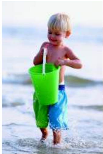
▲ For children (and grandchildren), playful times at Lake Geneva will be remembered for the rest of their lives.

For more detailed information about the Vacation House or the Lake Geneva property, call (847) 572-5200. Or, research it on the web, at www.thesouthshoreclub.com .