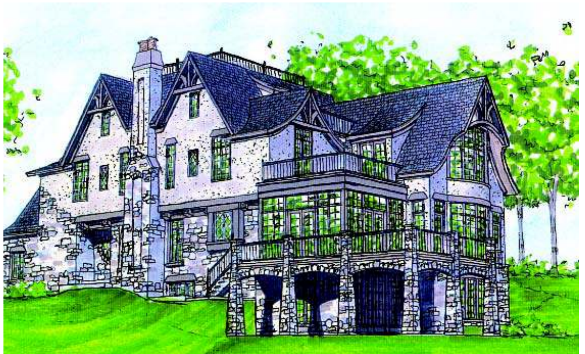
▲ Lake view elevation of The Vacation House on the shores of Lake Geneva