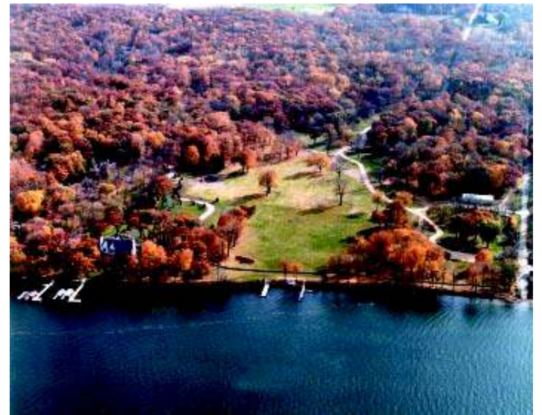
▲ An aerial view of the heavily wooded lakefront property at The South Shore Club. 90% of the original trees are being preserved.

Note: Lake Geneva is rich in history. We will continue this column in our next newsletter—Summer 2002.