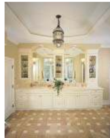
▲ Top: Custom cabinetry by CabinetWerks in the Master Bath of the Renaissance.com House; Below: The oval dining room of the Renaissance.com House. Just look at the millwork!

Box) all the way up to $3+ million (the Renaissance.com House and the Vacation House) in order to show potential clients idea after idea for their own magnificent homes. Among the most popular features have been the family workshop, first seen in the Organization House, the family message centers, multiple kitchen islands, Lutron lighting systems, cappacino bars, outdoor spas, screen porches, finished lower levels, and sports courts, all of which clients have repeated again and again in their own homes.