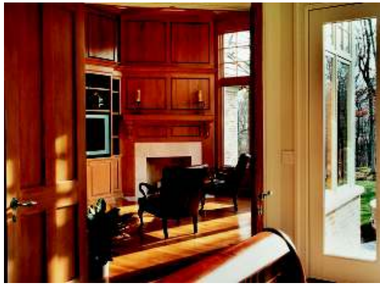
Top: The Great Room fireplace area and floors are quartersawn oak. Bottom: This warm, sunny study, rich in maple with quartersawn oak floors, is part of the first floor master suite in The Transition House.