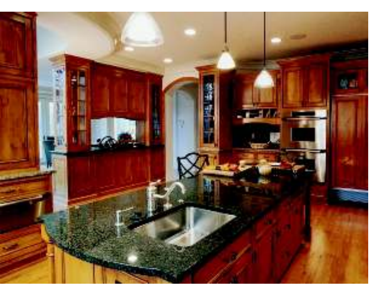
The Transition House's exquisite kitchen by CabinetWerks features Wood-Mode fine custom cabinetry. The island is slightly lower than normal, to accommodate the owner's needs.