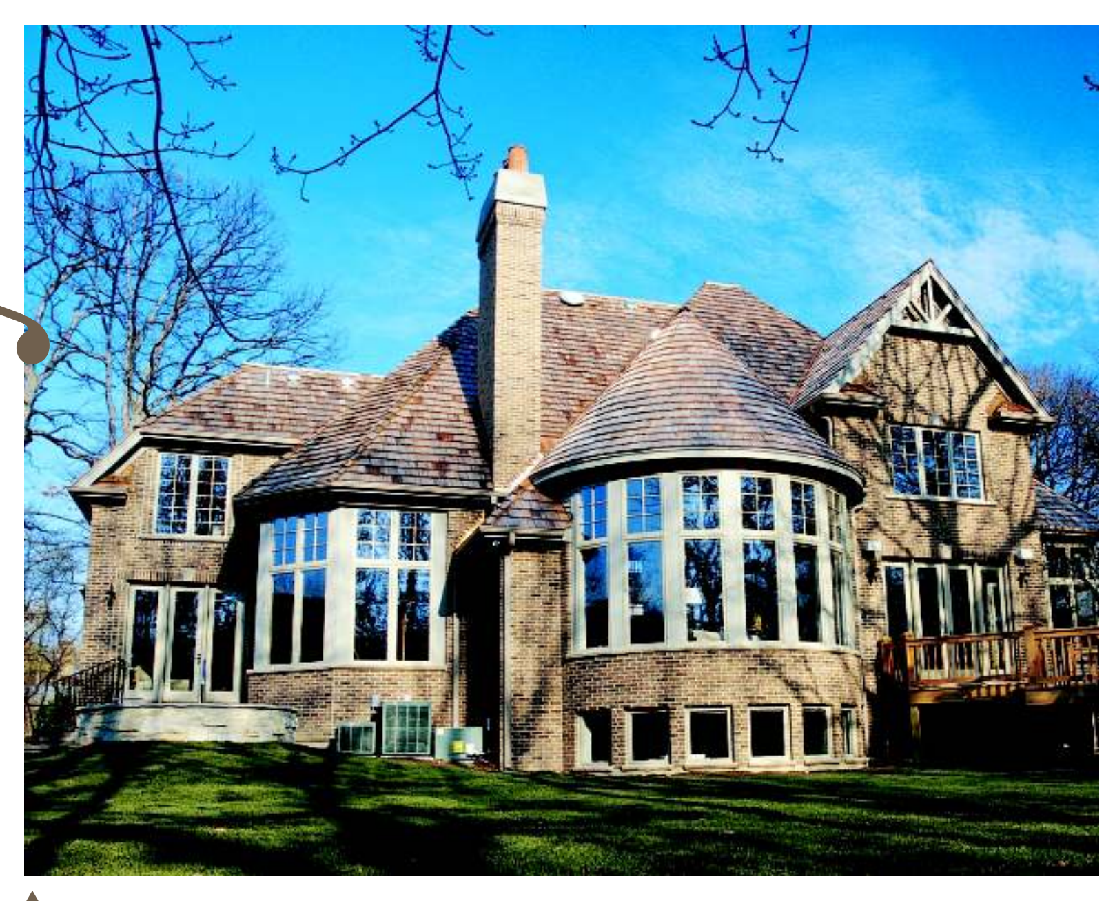
The rear view of The Transition House, with its spa to the left, deck to the right, and plenty of windows in between!