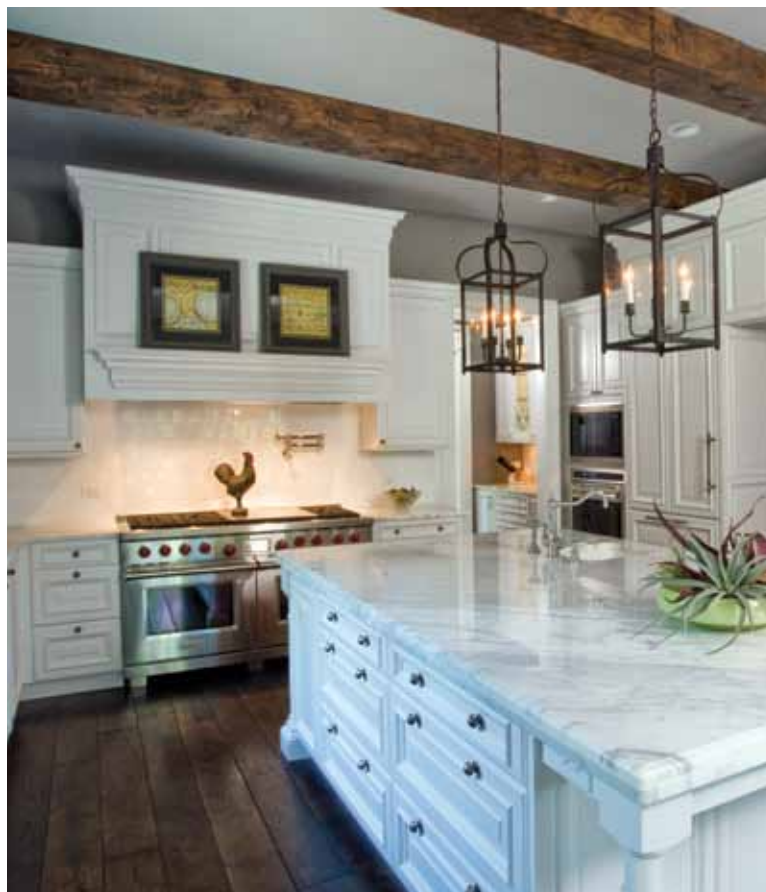
Orren Pickell Signature Collection cabinetry with Carrara marble countertops and reclaimed wood beam ceiling.

They looked to Orren's team to implement design elements from The Scottish Manor into their new home,