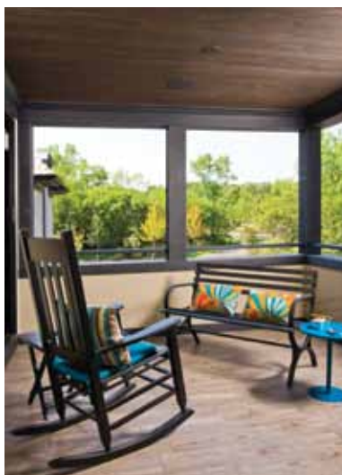
Left: Feel the breeze from the sleeping porch. Right: Custom cabinetry in the powder room.

Get inspired and see At Home Getaway for yourself when the home opens to the public for weekend tours. Join us from 11:00 AM to 4:00 PM on Saturday and Sunday, October 20 and 21, October 27 and 28, and November 3 and November 4. Admission is free, but donations of unused and unwrapped toys are being accepted at the door for Toys for Tots.