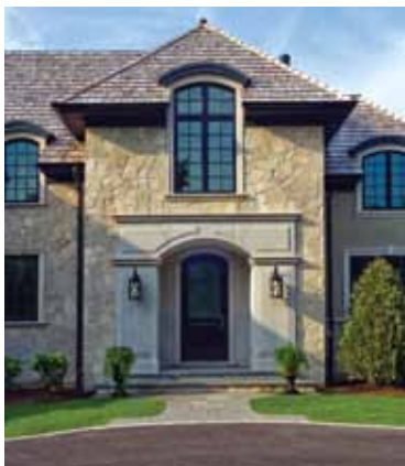
The stately limestone entrance to the Moreland Home.