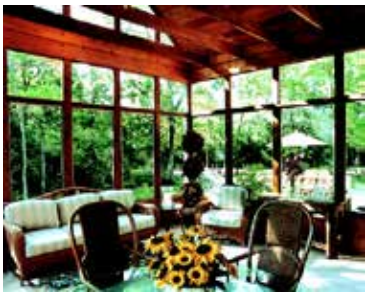
▲ Glorious natural light envelops this warm, delightful sun porch.