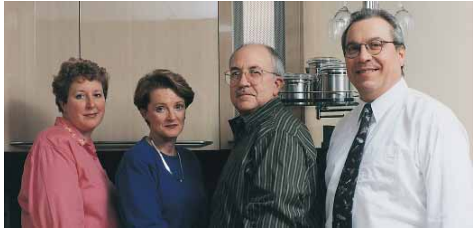
ORREN PICKELL DESIGNERS BUILDERS FINANCE DEPARTMENT